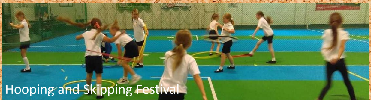
Hooping and Skipping Festival