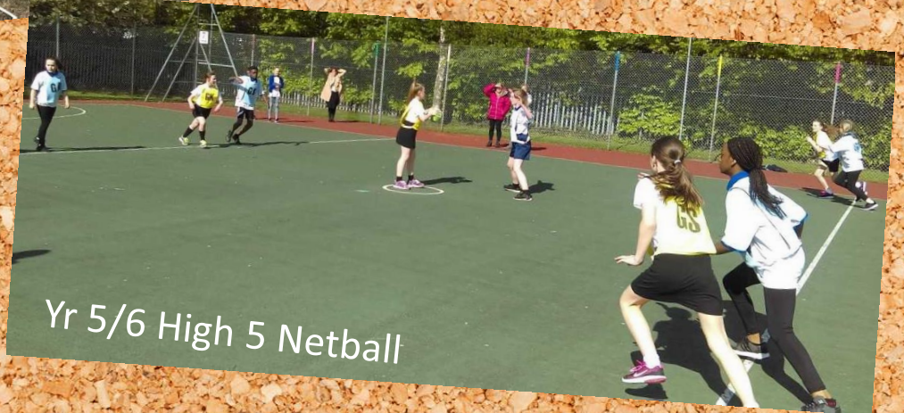
Yr 5/6 High 5 Netball