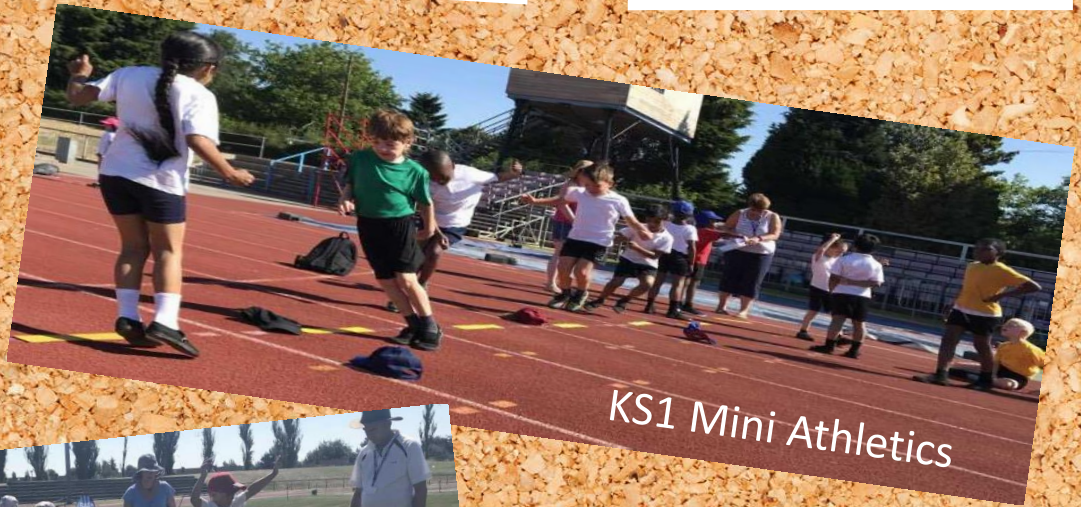
KS1 Mini Athletics