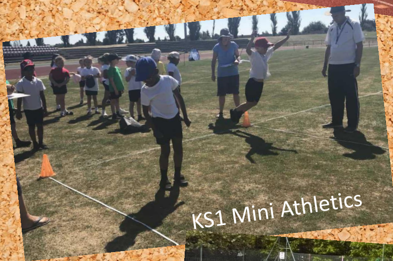
KS1 Mini Athletics